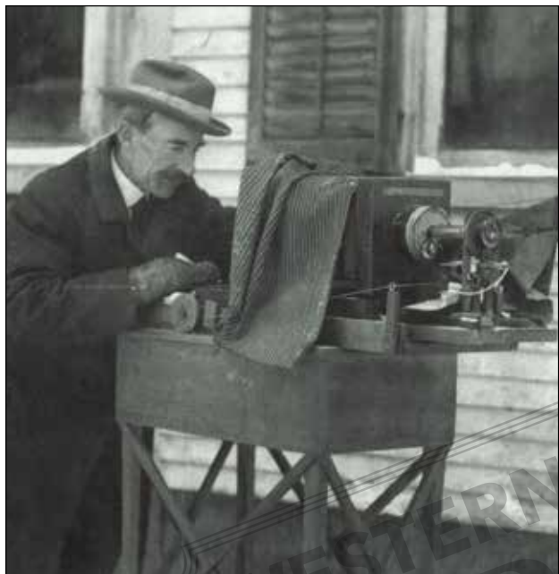
Wilson Bentley with the “apparatus” he created by connecting his camera with his microscope to allow the photographing of snowflake structure. He used the same equipment for the rest of his life.

It is possible that some would argue it is a bit cliché, or a least overly stereotypical, to create yet another piece that talks about snow and Western New York. But here we are—doing just that—but with a bit of a twist.