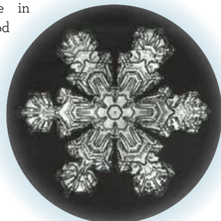
A few of the 5,000 snowflakes photographed by Wilson Bentley during his lifetime.