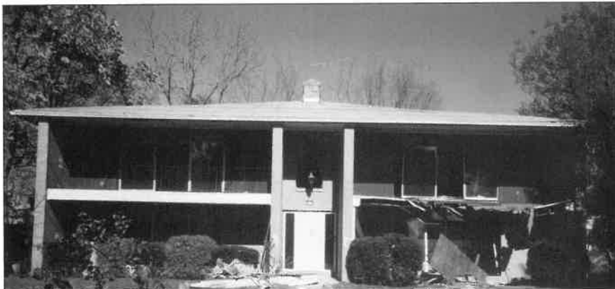
Parkway Apartments with recessed verandas.

Although not noteworthy in the context normally represented in “Last Look,” the Parkway Apartments played a significant role in the history of the Martin House Complex. Few regrets will be voiced over their loss. ❧