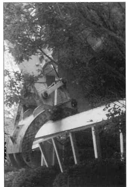
Demolition on the apartment house.