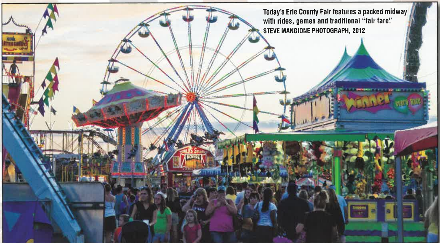
Today's Erie County Fair features a packed midway with rides, games and traditional "fair fare."